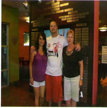
The Good Life Team participates in the Cook Dinner Program at Ronald McDonald House, Phoenix AZ