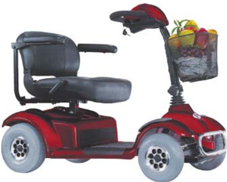
NOMAD 4 PF3 A medium-sized 4-wheeled scooter provides great stability and comfort.