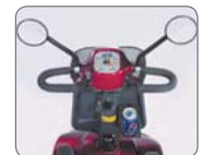
Delta Handle Bar