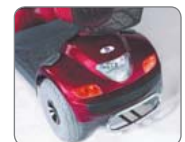
Steel Bumper Design (Optional)