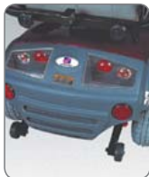
Compact Rear Shape