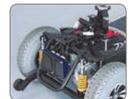
Rear Suspension System