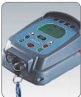
LED Control Panel