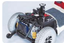
Rear Suspension System

A big-sized scooter modified from PF1, coming with a 700W 4-pole motor and a 160AMP controller, is ready to surprise you with its speed and torque.